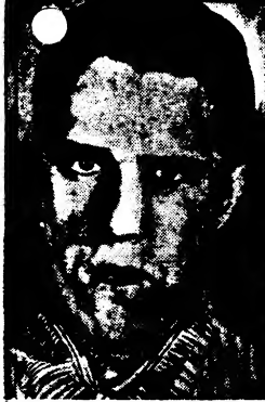
ALVIN KARPIS Age, 35; height, 5, 9%; weight, 150; build, slender; hair, brown; eyes, blue; complexion, fair; marks, 1-inch scar lower knuckle left index finger. Wanted for kidnaping.